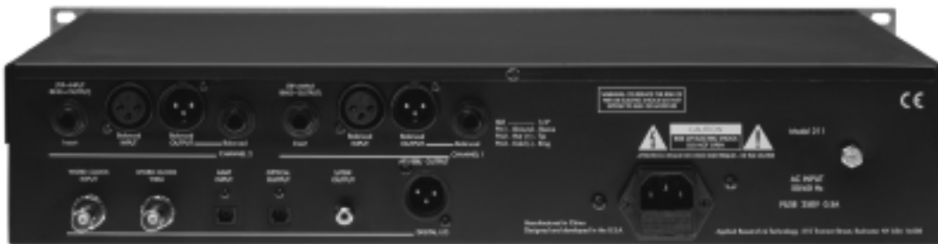
ART Digital MPA – Rear view image (above)